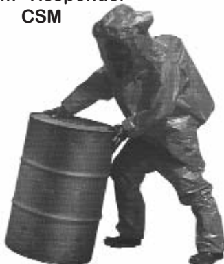
Tychem® Responder® CSM