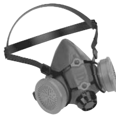
550030M Half Mask shown with 7580P100 Cartridge