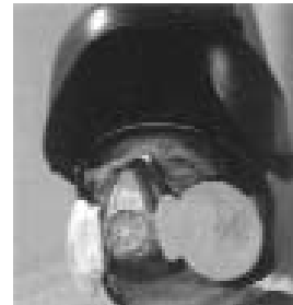
Flexi-Filter Filters, P100 Part No. 805408

These low-profile, flexible filters fit well under a welding hood and with other personal protective equipment. They offer great balance and weight distribution for maintaining a good face seal, while their swept-back design provides improved vision and comfort. In addition, their multi-layer composite construction gives them better durability and spark resistance. Finger tabs provide easy installation and prevent possible filter damage.