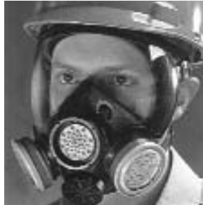
Advantage® 1000 Facepiece (medium) Part No. 805408