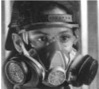
Advantage® 200 Facepiece (medium) Part No. 815692