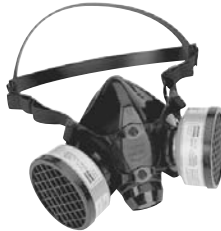
770030L Half Mask shown with N75003 Cartridges