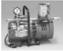
Part No. 9821

Fills the need for a very portable air source for one or two respirator users or a single hood user. Works well in a variety of work environments including painting or refinishing booths. For two respirators or one hood.