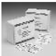
Part No. 1001-05

Available with the same cleaning ingredients as our Cleaning Pads, these extra large 8" x 11" towelettes are perfect for big cleaning jobs such as full face and supplied air respirators. 50 per box.