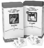
Part No. 3001

For use on respirator facepieces where the manufacturer recommends using a non-alcohol cleaning wipe. Active ingredient: Benzalkonium Chloride. Will not harm even the most sensitive rubber facepieces. 100 towelettes per box.