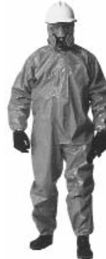
Tychem® CPF® 2