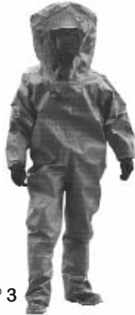
Tychem® CPF® 3