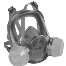
54001 Full Facepiece shown with 7581P100 Cartridges

The 5400 Series provides the comfort and protection you would expect from North, at an unbeatable price. No other full facepiece in its price range offers such quality, engineering and attention to detail. Weighing only 14 ounces, the 5400's lightweight design offers a level of comfort that ensures greater worker acceptance. Plus, its facepiece seal is made from a soft, pliable elastomer material with high chemical resistance to assure excellent comfort, fit and performance.