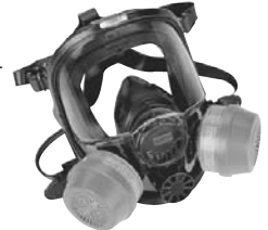
76008A Full Facepiece shown with 7584P100 Cartridges

The 7600 Series Full Facepiece respirators are designed to provide eye, face and respiratory protection while ensuring optimal comfort and performance. Its dual flange silicone seal gives this facepiece superior fitting characteristics. The hard-coated polycarbonate lens provides over 200° field of vision and protects the wearer's eyes and face against irritating gases, vapors and flying particles. The lens also provides excellent optics, is scratch resistant and meets ANSI standards for impact and penetration resistance. The 7600 Series Full Facepiece sets the standard for full facepiece protection.