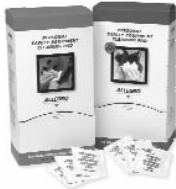
Part No. 1001

Large (5" x 8"), individually foil-packaged towelettes contain 70% Isopropanol and are designed specifically for rubber respirator facepieces and other personal safety equipment. The box is designed as a wall mounted dispenser, or can be wall mounted using the box holder. 100 towelettes per box.