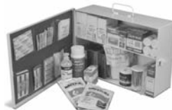
Food Service Kits Bulk