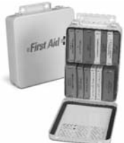
Food Service Unit Kits